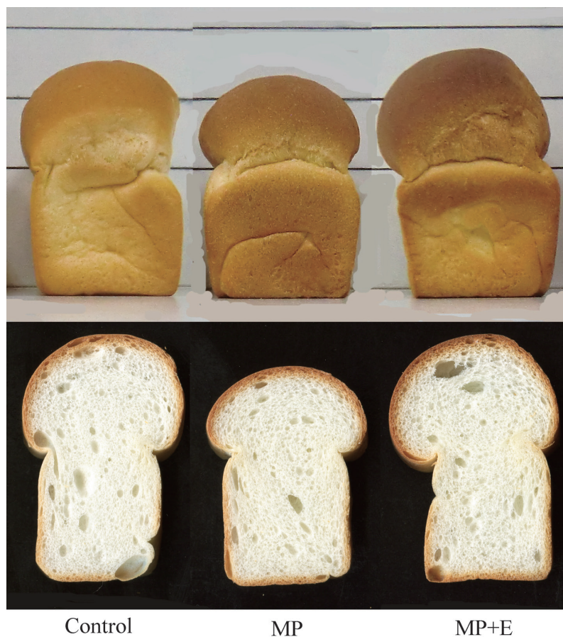
Fig. 1. Photographs of appearance and scanned crumb images of breads of Control, MP, and MP+E 1)

1) MP: mashed potato, E, enzymes. Optimal amounts of enzymes, \alpha -amylase and hemicellulase, were added in dough of MP+E.