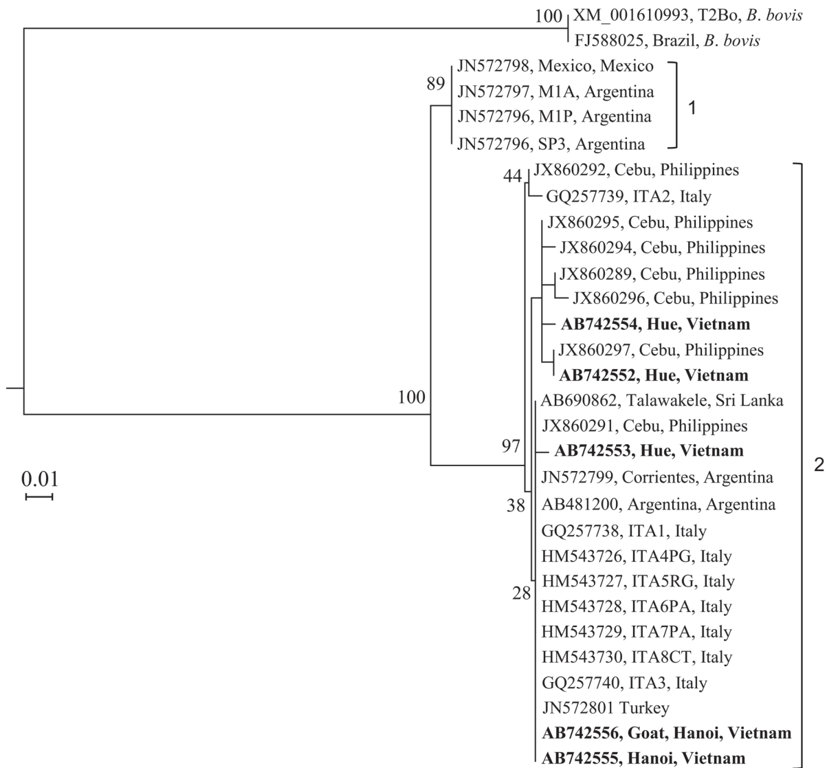
Fig. 2. Phylogenetic analysis of B. bigemina -AMA-1 gene sequences. Sequences generated in the present study (n=5) are indicated by boldface-type letters. Note that all the Vietnamese sequences are in clade 2.

Two T. theileri CATL gene sequences (AB742558 and AB742562) shared high sequence identities (99.6 and 98.2%, respectively) with their Brazilian counterparts (GU299367 and GU299405, respectively), while 2 other sequences (AB742560 and AB742561) were identical to sequences from the United States (GU299391 and GU299392) and Philippines (JX860299) (Fig. 3). In addition, a CATL sequence from the Philippines (JX860299) shared high sequence identity (97.8%) with a Vietnamese sequence (AB742558). Based on a previously described classification method for the phylogenetic positions of T. theileri -CATL gene sequences [12], the gene sequences can be grouped into 2 major clades, TthI and TthII, which can be further divided into several sub-clades (Fig. 3). In the present study, the CATL sequences from Vietnam were found in three different