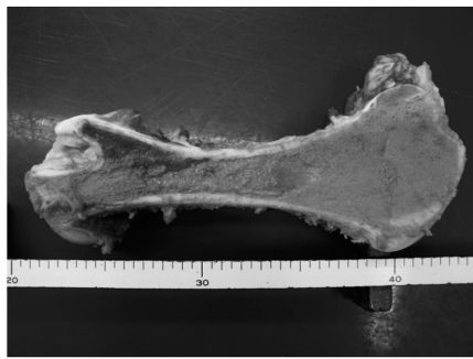
Fig. 1. Femoral bone marrow was pale pink.